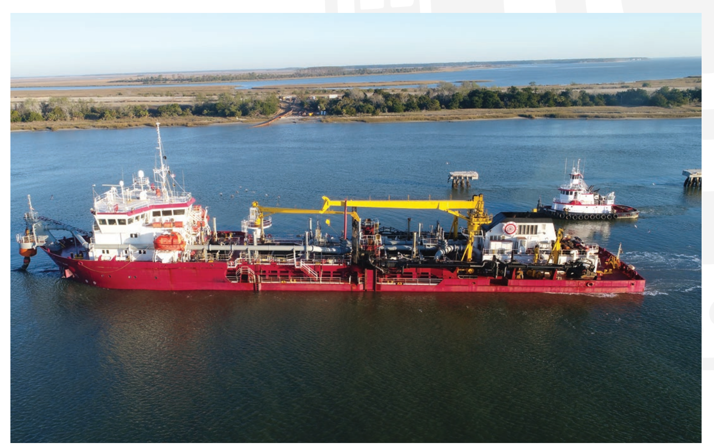
Dredge Liberty Island Creating Habitat from Deepening of Savannah Entrance Channel