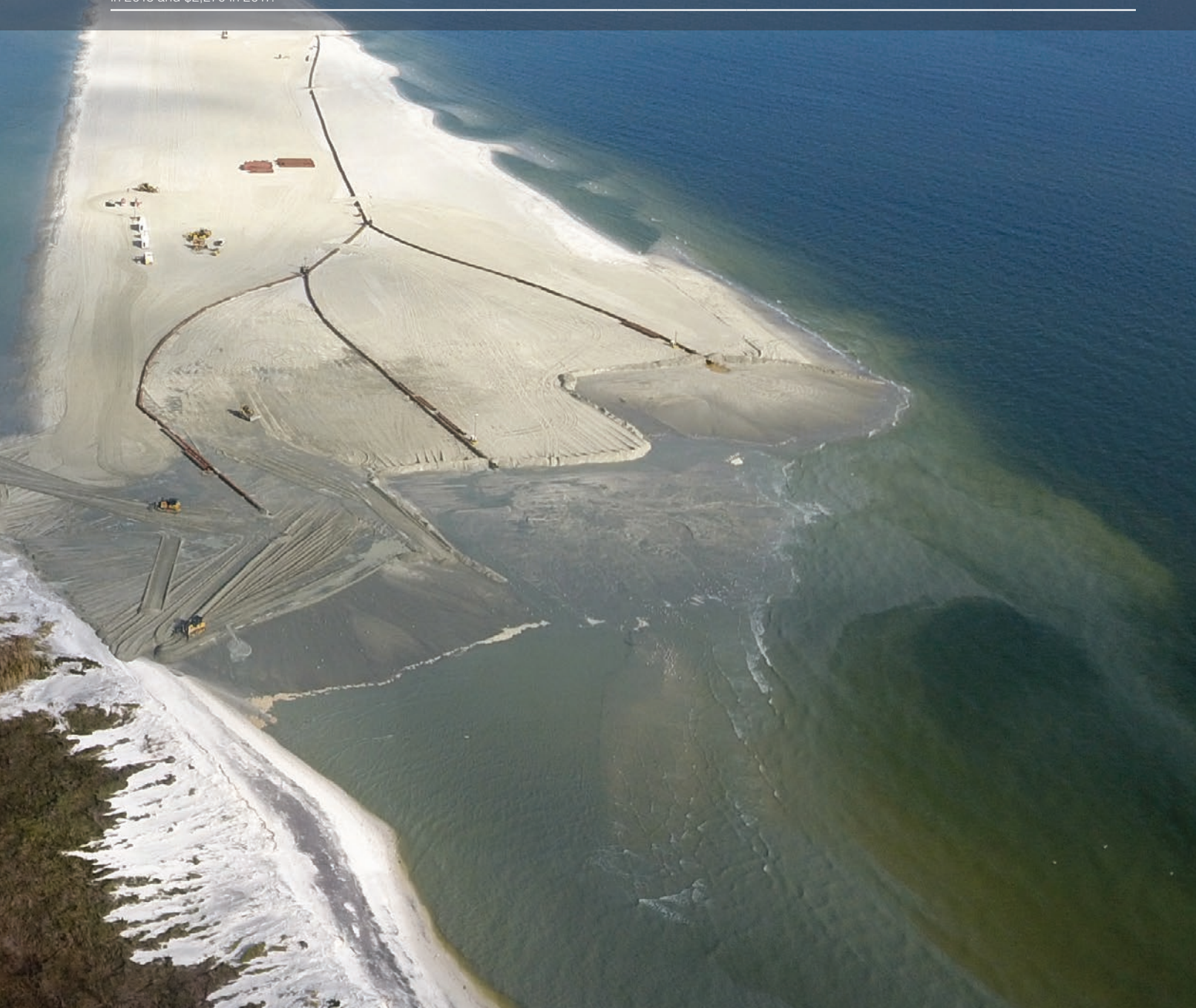
MSCIP Comprehensive Barrier Island Restoration Plan—U.S. Gulf of Mexico, Offshore of Gulfport Mississippi