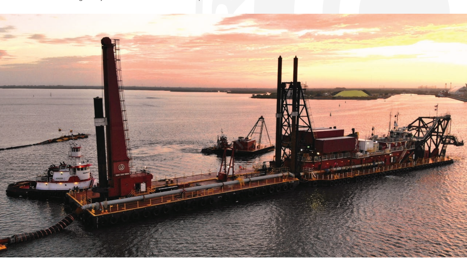
Dredge Alaska at Sunset-Big Bend Channel Port Deepening, Tampa Bay, Florida