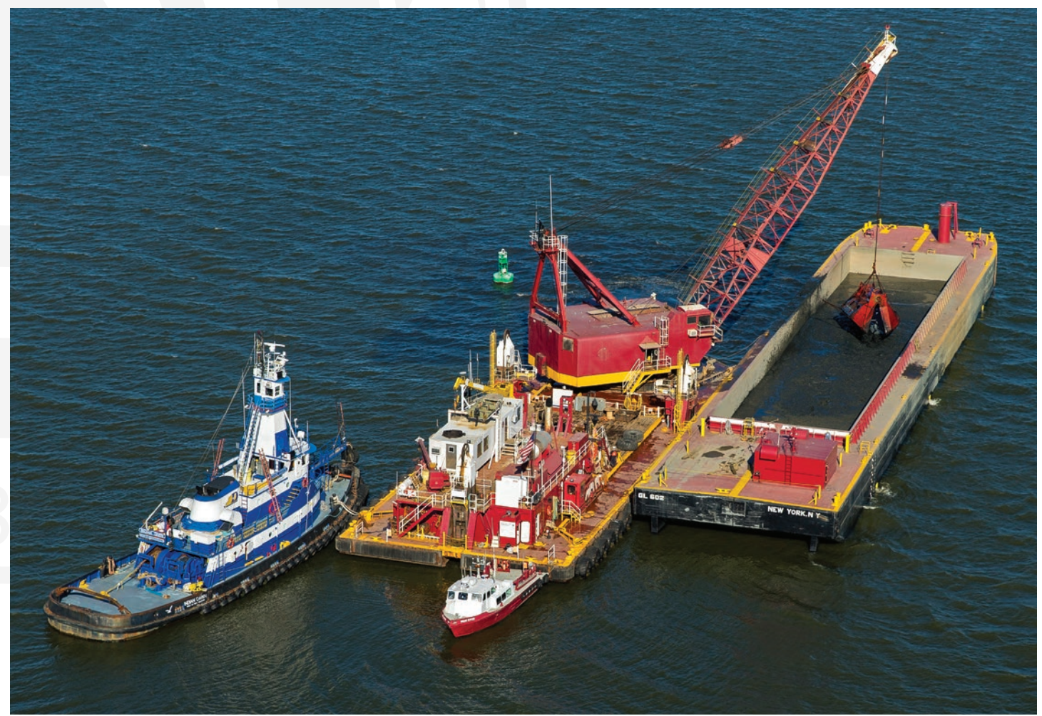
Clamshell Dredge 54 Performing Maintenance Dredging—Baltimore, Maryland