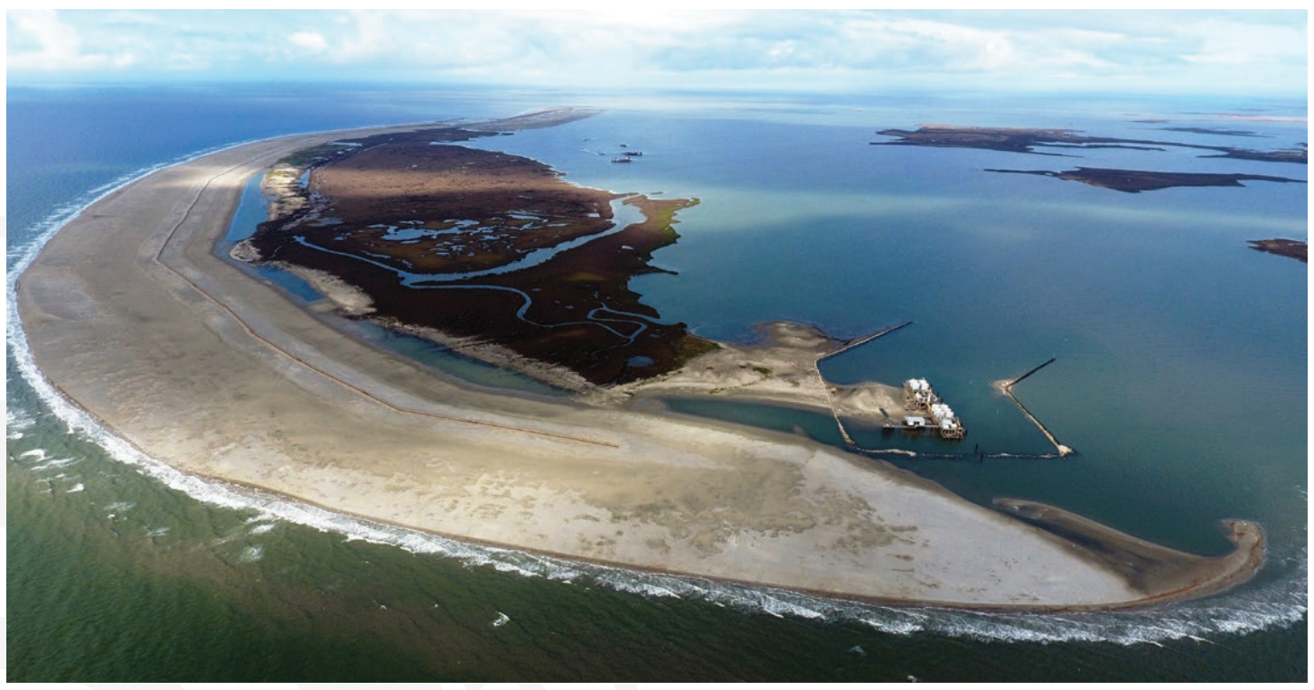
Whiskey Island Coastal Protection Project East End—Terrebonne Bay, Louisiana