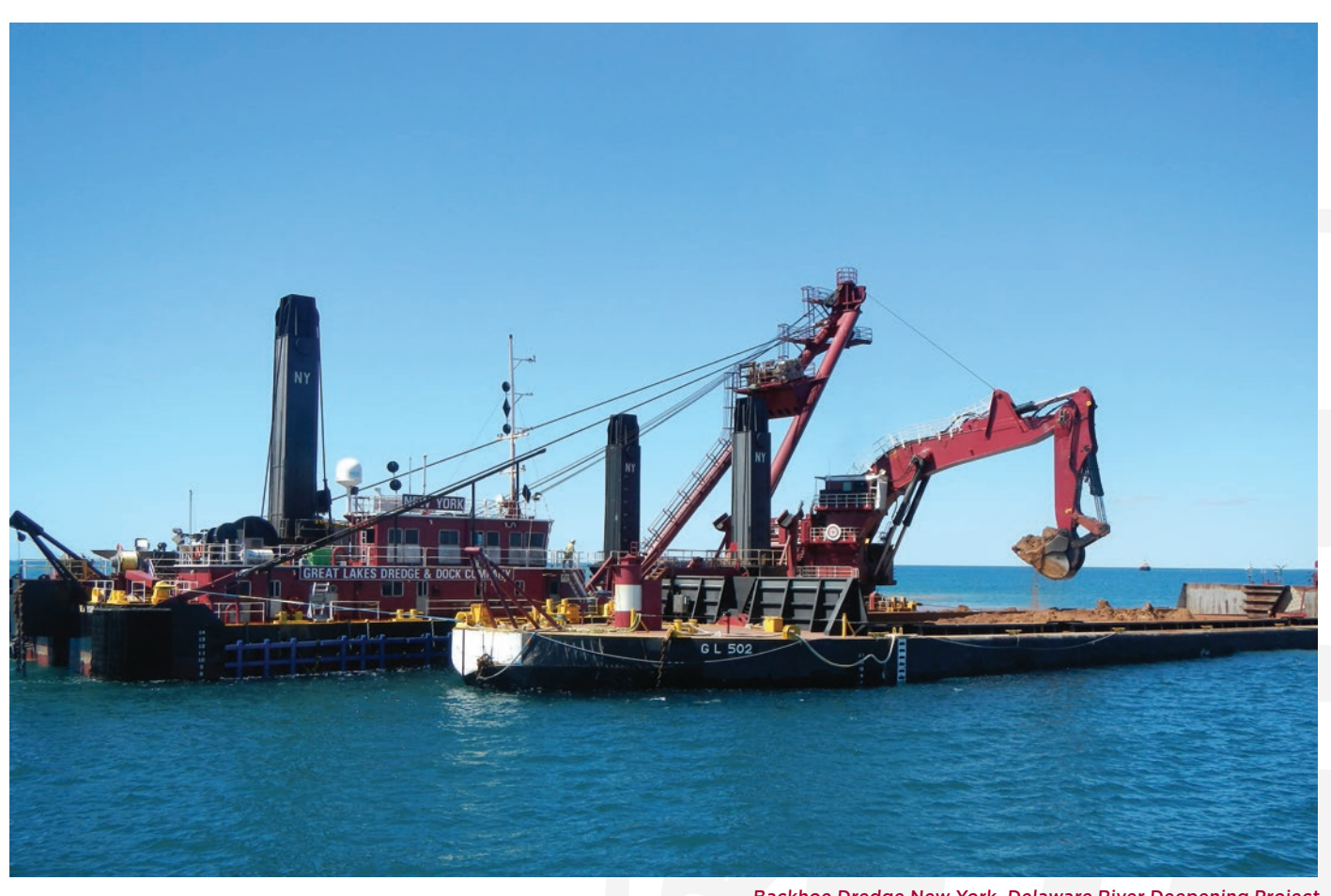
Backhoe Dredge New York, Delaware River Deepening Project