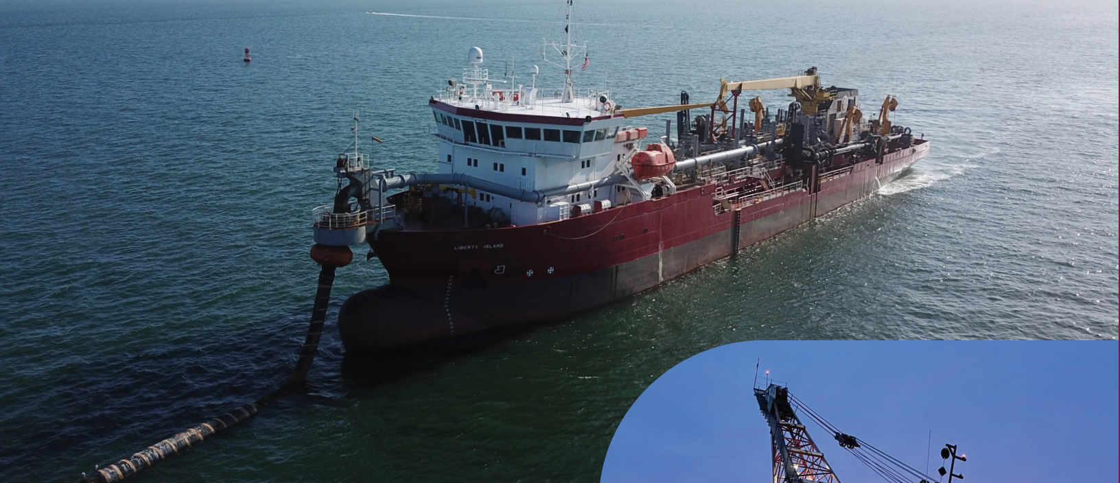
TOP: West Beach in Gulf Shores. Gulf Shores Beach Restoration, Alabama.