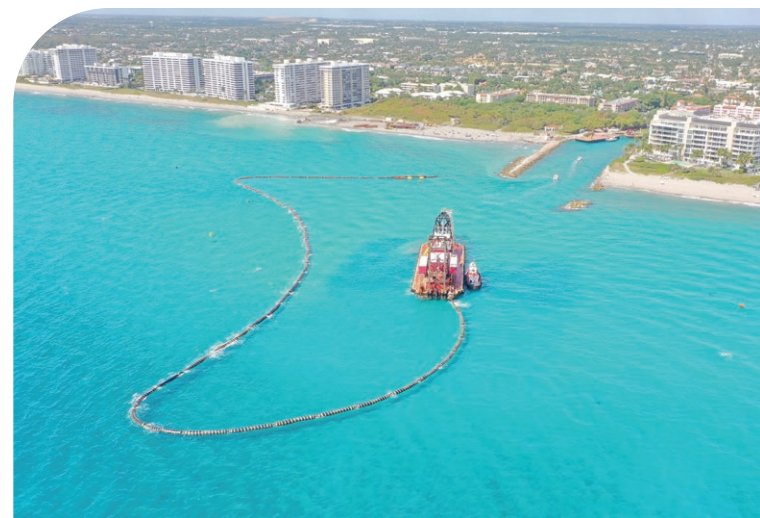
Cutter Dredge Alaska pumping beneficial use dredged material to Boca Raton, Florida, during maintenance dredging for the City of Boca Raton, City of Deerfield Beach, and Town of Hillsboro Beach, Florida.