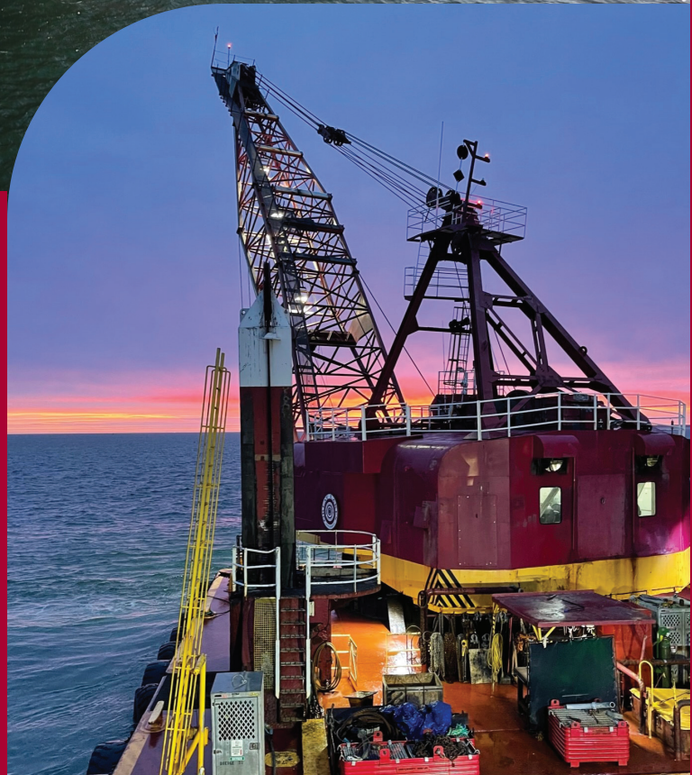
RIGHT: Clamshell Dredge 55 working for the Virginia Port Authority to deepen and widen the Thimble Shoal Federal Navigation Channel.