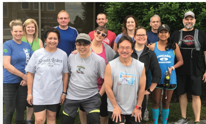
Making Strides Against Breast Cancer Walk