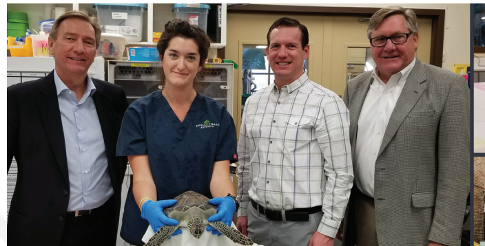
Georgia Sea Turtle Center