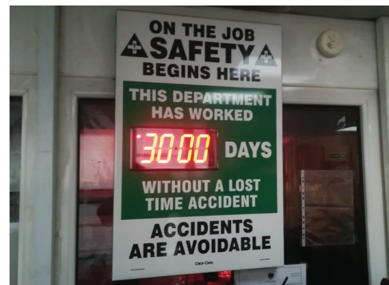
Dredge Ohio's Safety Milestone