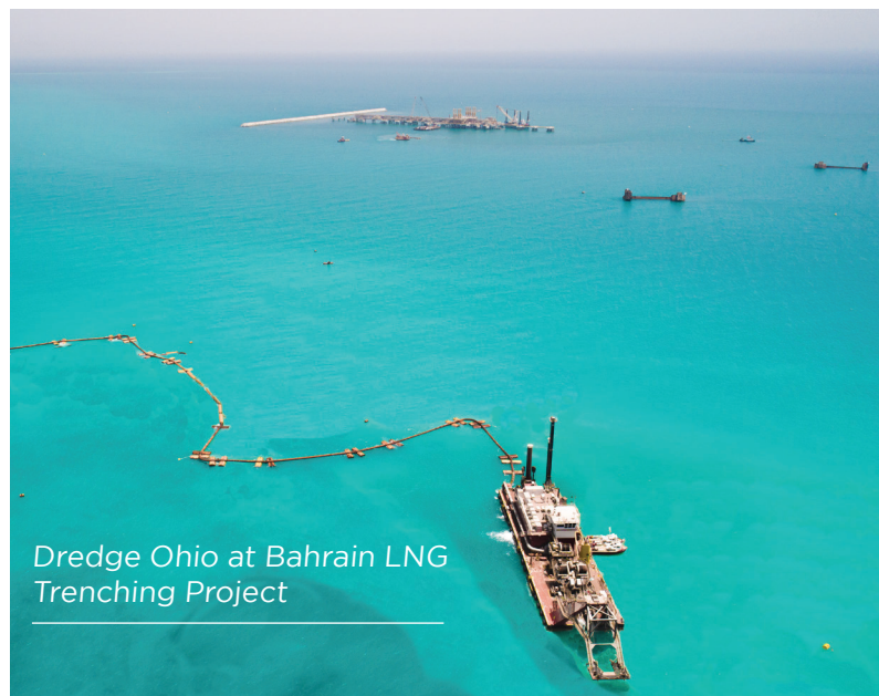
Dredge Ohio at Bahrain LNG Trenching Project

Our principal ES&G areas of focus are outlined on the following pages.