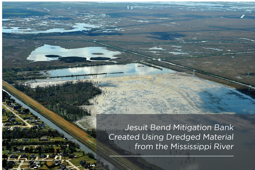
Jesuit Bend Mitigation Bank Created Using Dredged Material from the Mississippi River

Some examples of these projects are the Jamaica Bay (NY) wetlands creation program which came out of partnering discussions with the USACE to utilize dredged material to rebuild eroding wetlands; Kings Bay (GA) regional sediment management which takes dredged material which used to go to sea due to costs and rationalizes the costs in combination with a nearby beach project to create beach habitat; and Jesuit Bend mitigation bank which is the first of its kind mitigation bank to create wetlands using material dredged from the Mississippi River. Rock dredged from the deepening of the Miami Entrance Channel was used to create the Julia Tuttle Mitigation Habitat, and one of the biggest BUD success stories is ongoing in the Mississippi River where land is being created every year as part of changes made to the annual maintenance dredging of the lower Mississippi.