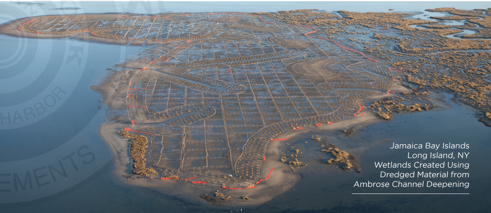
Jamaica Bay Islands Long Island, NY Wetlands Created Using Dredged Material from Ambrose Channel Deepening

Some examples of these projects are the Jamaica Bay (NY) wetlands creation program which came out of partnering discussions with the USACE to utilize dredged material to rebuild eroding wetlands; Kings Bay (GA) regional sediment management which takes dredged material which used to go to sea due to costs and rationalizes the costs in combination with a nearby beach project to create beach habitat; and Jesuit Bend mitigation bank which is the first of its kind mitigation bank to create wetlands using material dredged from the Mississippi River. Rock dredged from the deepening of the Miami Entrance Channel was used to create the Julia Tuttle Mitigation Habitat, and one of the biggest BUD success stories is ongoing in the Mississippi River where land is being created every year as part of changes made to the annual maintenance dredging of the lower Mississippi.