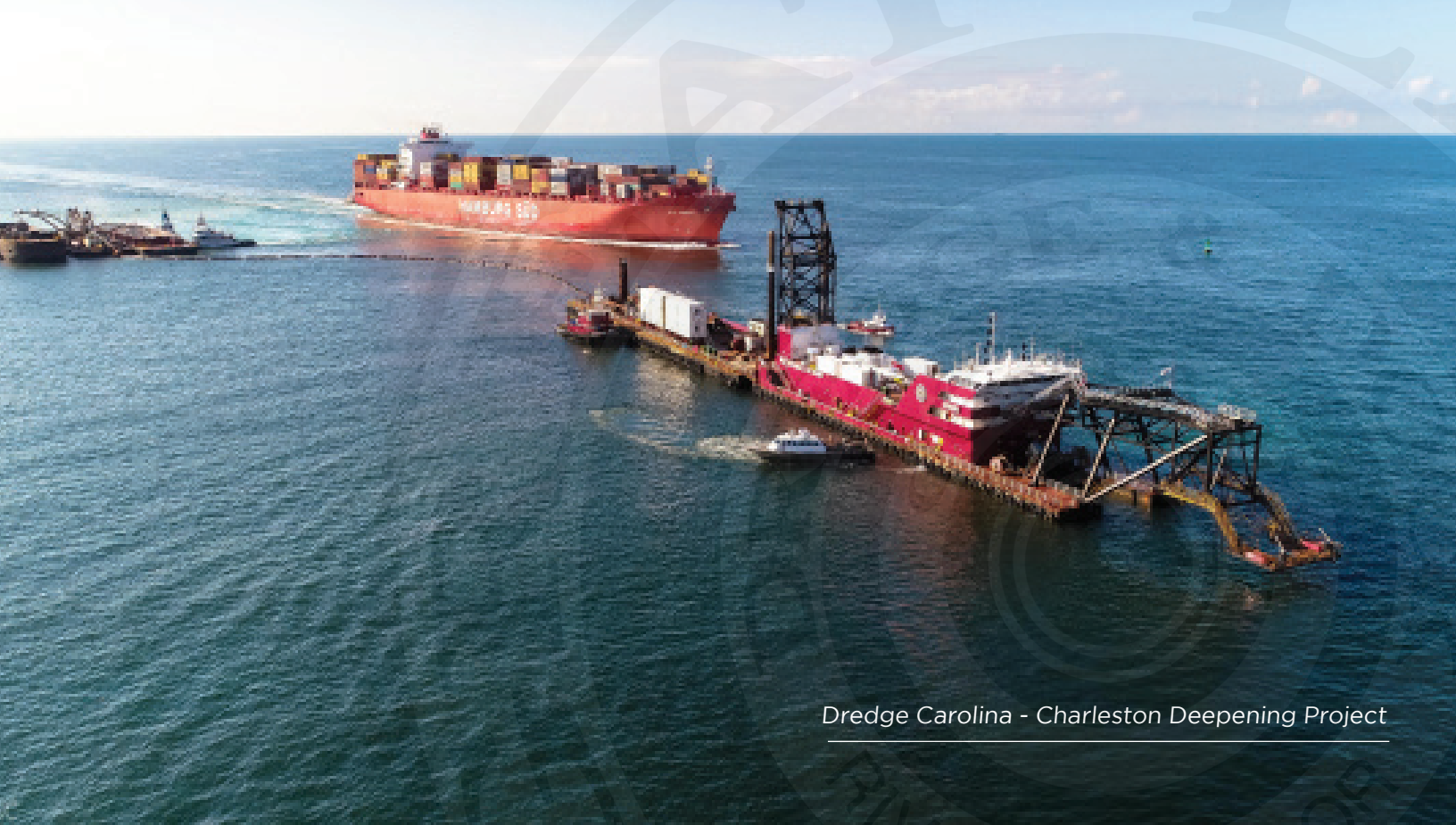
Dredge Carolina - Charleston Deepening Project