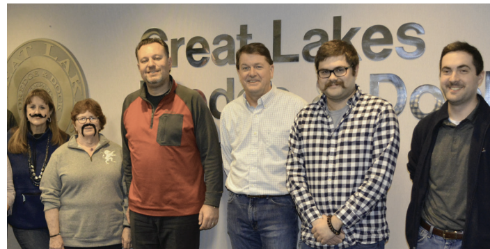
Movember Men's Health Awareness