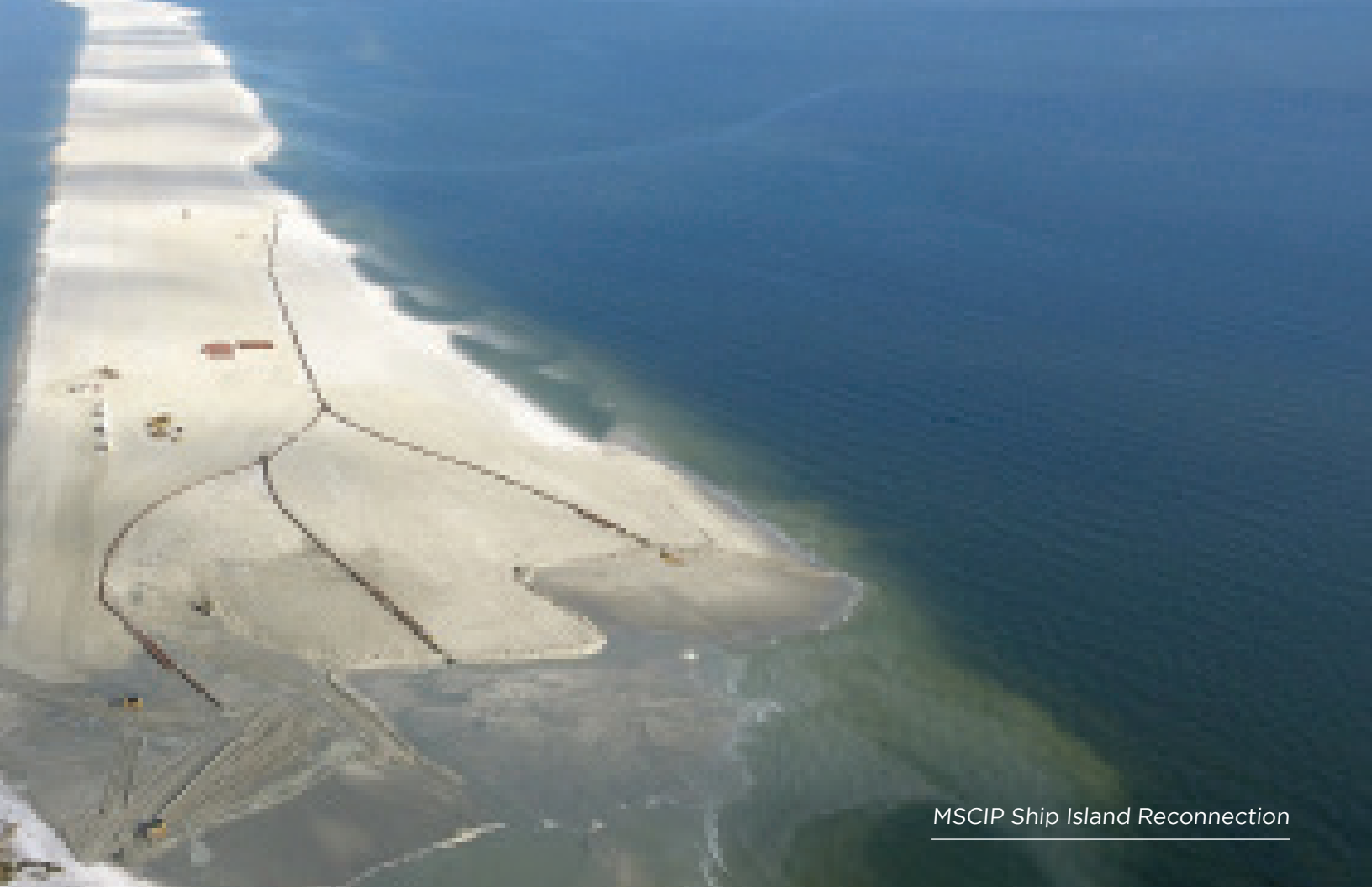
MSCIP Ship Island Reconnection