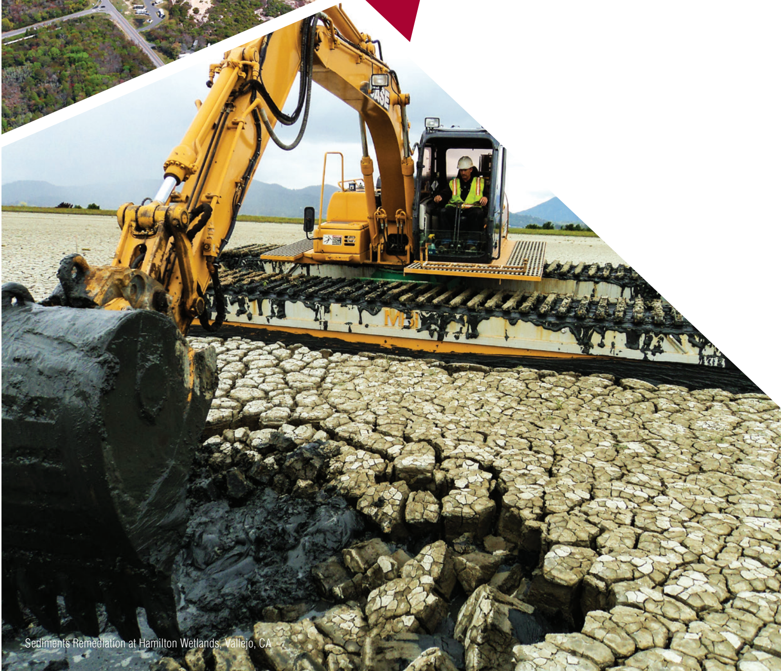
Sediments Remediation at Hamilton Wetlands, Vallejo, CA